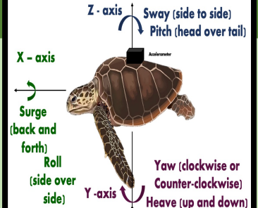
Fig 1. Accelerometer Diagram