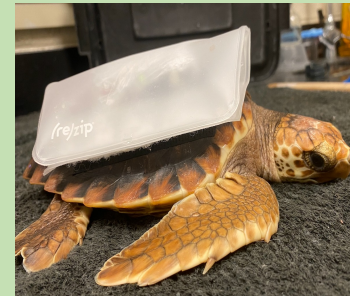
Fig 2. Accelerometer on turtle