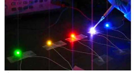
Quantum dot technology allows higher efficiencies and more accurate colors than possible with traditional LEDs.