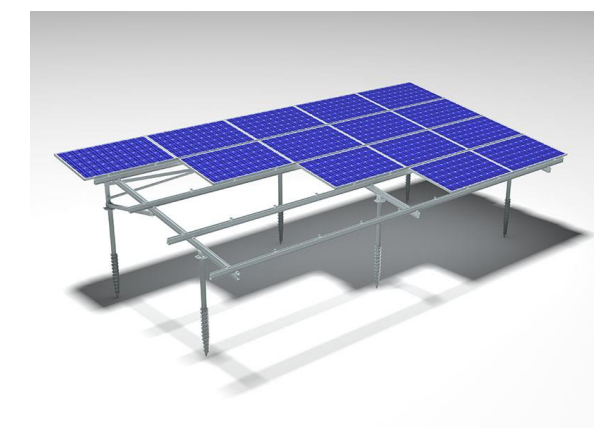
Conventional aluminum framing