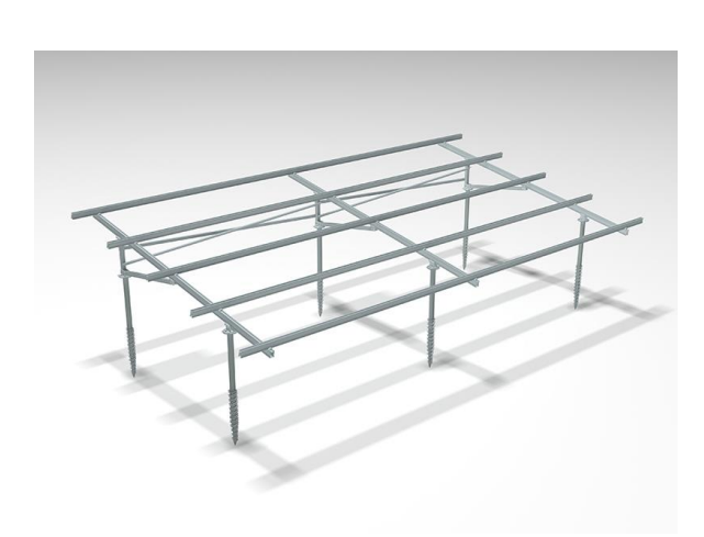
Composite polymer racking