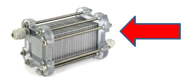
AAEM fuel cell generates ammonia directly from air water and solar energy