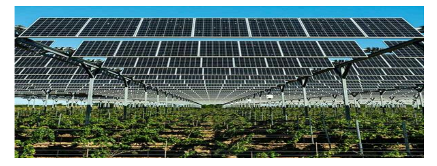
Bifacial solar panels allow organic farmers to generate $800K/acre per annum