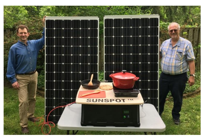
Figure 1 - First Generation SUNSPOT

TEAM SUNSPOT, Germantown, MD 20874 https://sunspotpv.com/