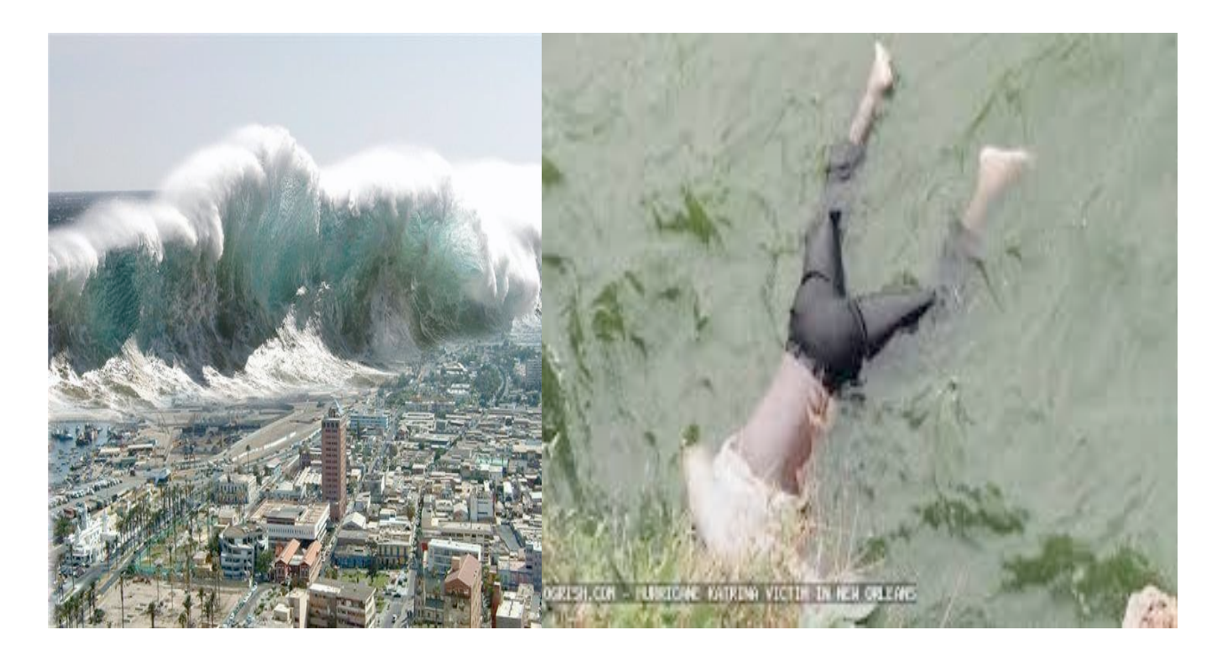
Tsunamis: Clean Water and Power for Years