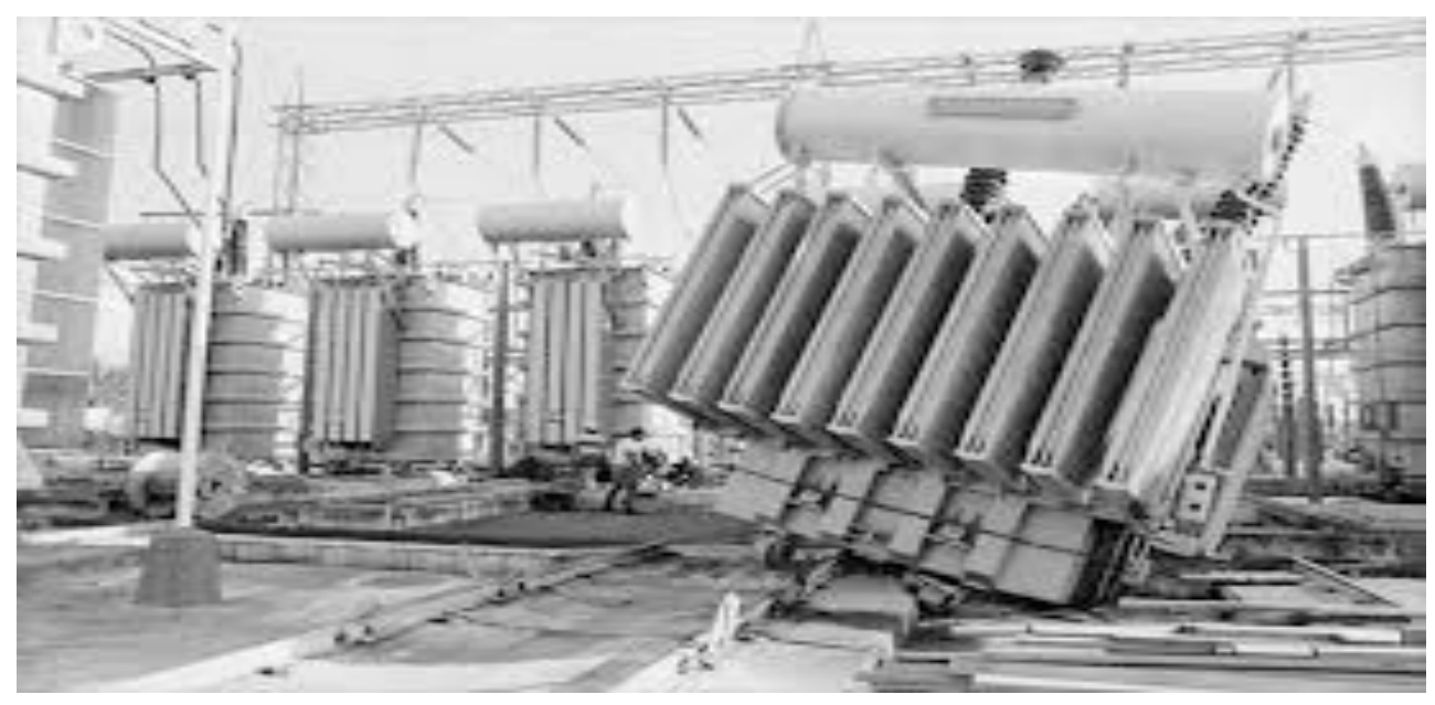
Earthquakes: Lost power for Weeks