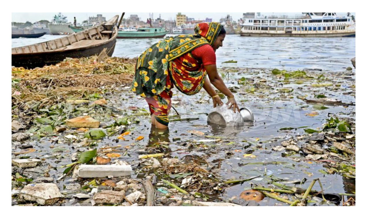
Floods: Water Polluted for Months