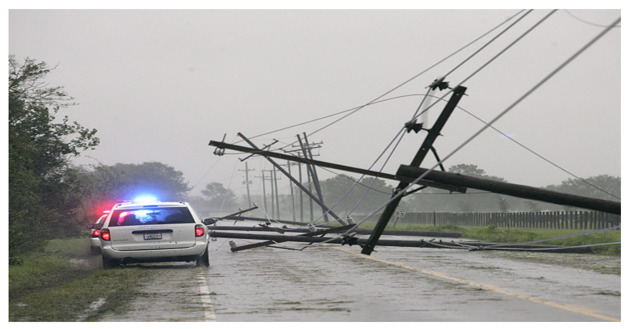
Storms: Lost power for Days