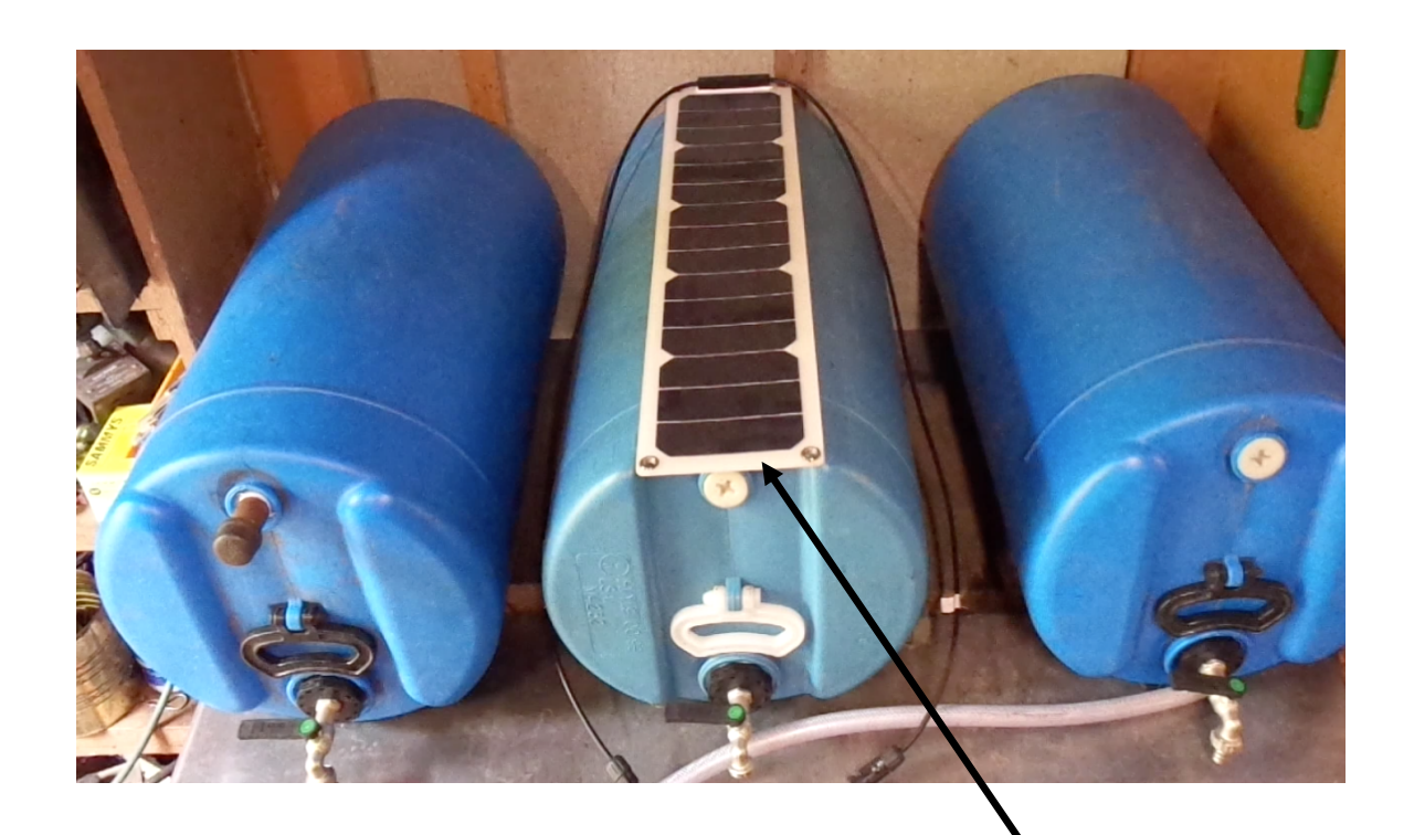
Solar Panels with UV Window

Rugged Trailer Mounted PWTS 500-1500 gallons/day