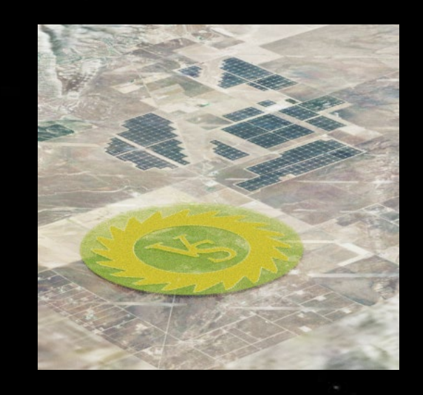
Receiving Antenna converts energy to electricity

Vittus Solis Clean, low-cost, safe, always available solar power - to anywhere, anytime in any weather