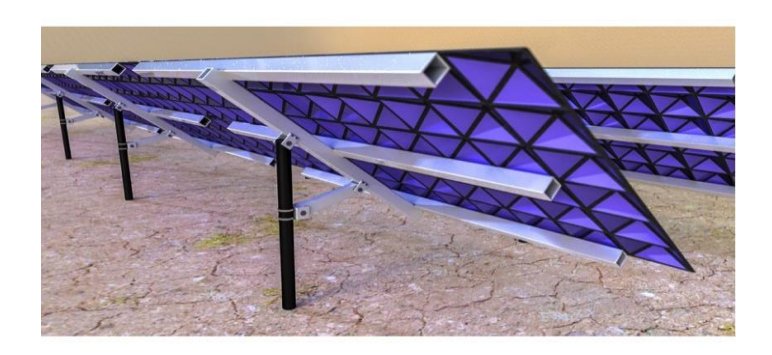
Fig 3: 3D array solar module installation at future solar farms

We believe in further increasing the efficiencies to 25% -- 30% with newly designed thin film process technologies & thin film chemistries and assembling the modules in 3 -- Dimensional array as represented at Fig 3. Below