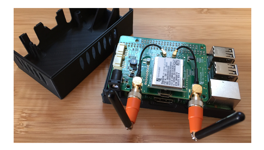
Prototype of an ethernet cellular gateway on a Raspberry Pi with a 3D printed enclosure.