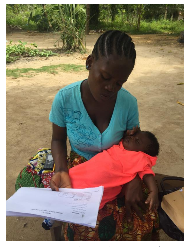
Figure 1: A Learning Links learner learning to read from a literacy curriculum (in her right hand), holding her child, an preparing to answer an SMS quiz question (note the mobile phone to her right on the bench)

Innovation/Resources: Kaizen/Learning Links's innovation taps into on an exciting but underutilized resource: literate and numerate Liberian women who want to help their communities and