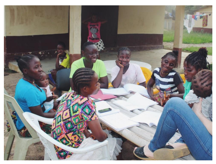
Figure 3: A learning group of young women, accompanied by their children. Learning Links has gained unanticipated momentum because the learning groups also serve as a social activity that attract intense interest wherever they happen

Kaizen/Learning Links is testing permutations of the incentive structure to reduce the cost of incentives that the program provides. For instance, we are experimenting with reducing the incentives/learner a tutormentor receives as the number of learners they support increases. In this way the tutor-mentors' income will still increase as they support more learners, but the costs to the program will decrease. Table 1 shows how tutormentor incomes will increase and program costs decrease if the tutormentor receives equal