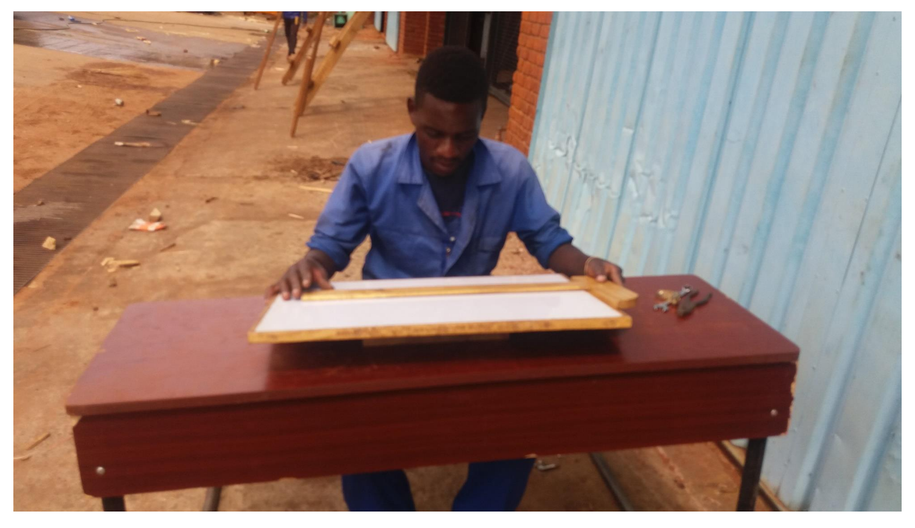
FIGURE 1. 1 A STUDENT DEMONSTRATING HOW THE DRAWING SET IS USED