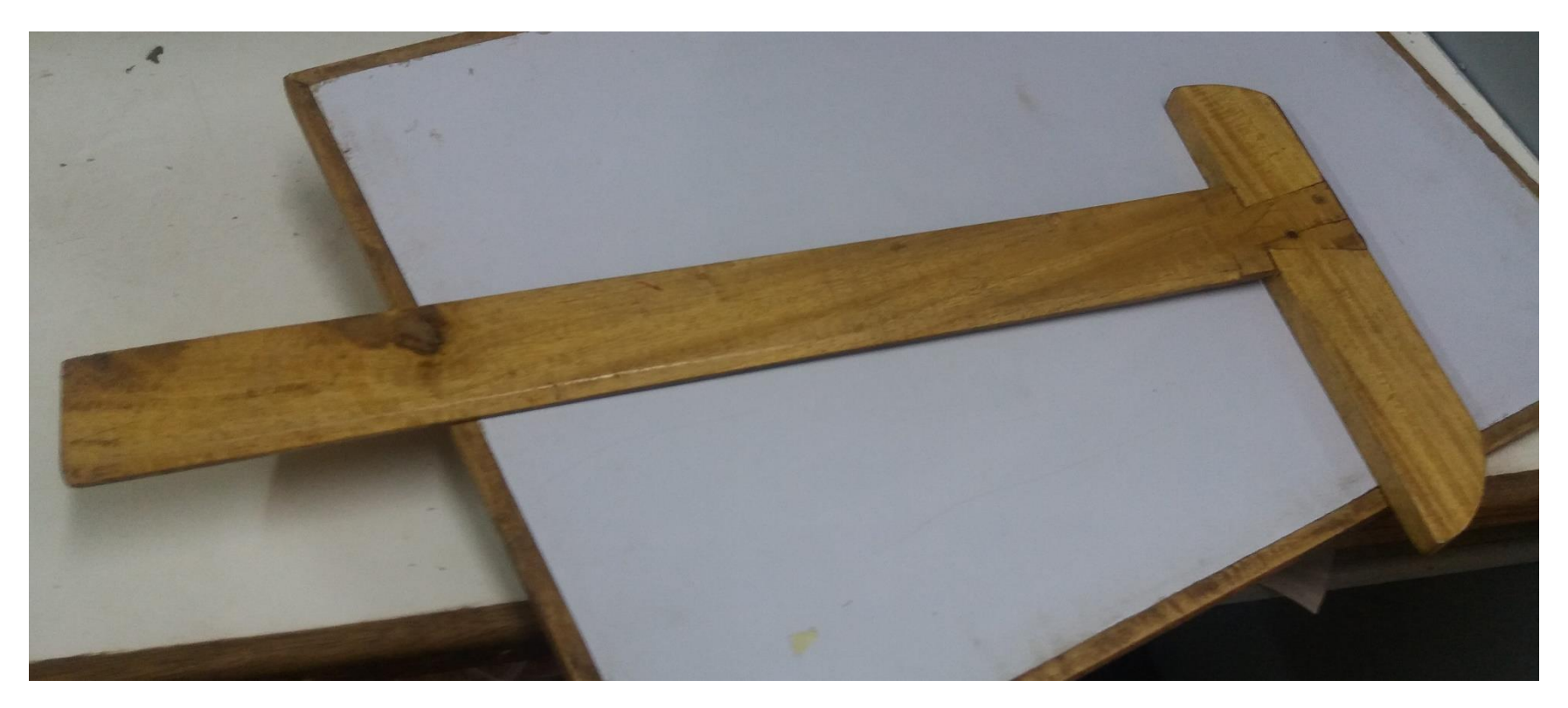
FIGURE 1.3 SHOWS A T-SQUARE WITH A SLANTED EDGE AT ABOUT 30 DEGREES. THIS WAS SCIENTIFICALLY DESIGNED TO THAT ANGLE TO ALLOW EASIER DRAWING OF LINES WITH A DRAWING PENCIL.