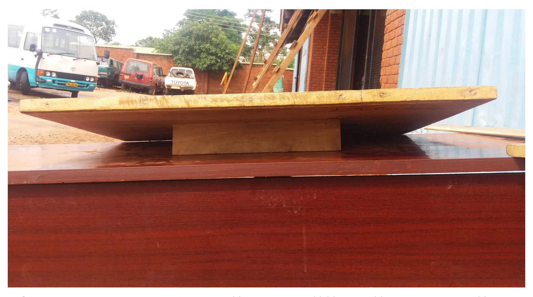
FIGURE 1.2 SHOWS A DRAWING BOARD WITH A WEDGE AT ITS BASE. THIS IS AN INNOVATIVE PART OF THIS DRAWING BOARD. IT OFFERS COMFORTABILITY WHEN DRAWING WHICH IS QUITE DIFFERENT FROM MOST OF THE DRAWING BOARDS YOU'LL FIND ON THE MARKET WHICH HAVE A FLAT SURFACE AT ITS BASE MAKING IT DIFFICULT TO DRAW EFFECTIVELY.