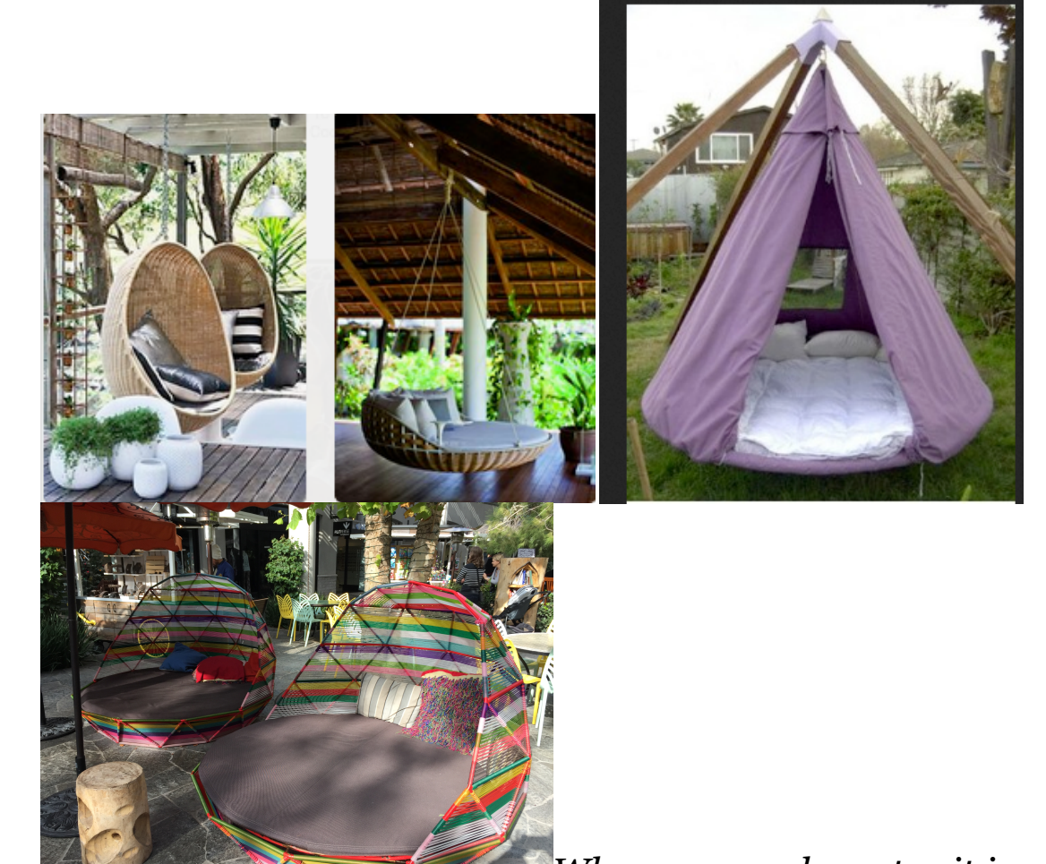
Who says you have to sit in uncomfortable chairs all lined up?