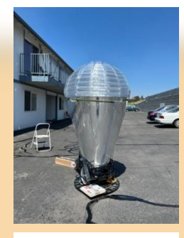
Fig.4 Prototype of the inflatable nonimaging non-tracking solar concentrator based CPV system on a e-bike trailer