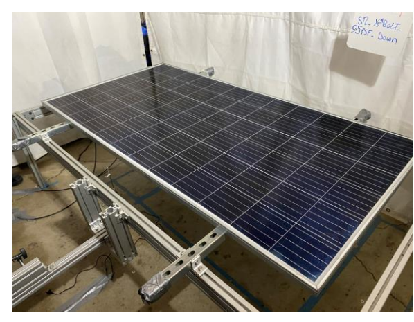
Steel frame undergoing UL and IEC testing