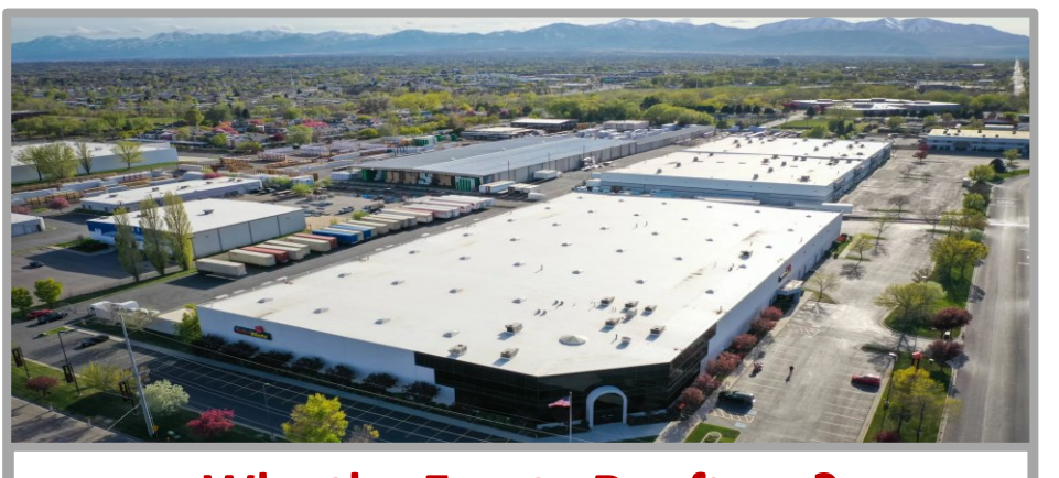
Why the Empty Rooftops?